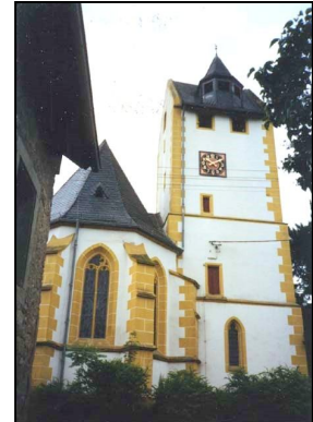
1990, Church - Niederhausen - Haas Family

Birth: 29 Oct 1846 Niederhausen, Rheinland-Pfalz, Germany 1,5,6,9,11,12,13,14,16,17,20,22,23,24,25,26,27,28,29,30,31,32 - Date of Birth: 29 October, 1846 [4] [5] [6] [7] [8] [11] [15] [17] - Date of Birth: 25 Oct 1846 [12] - Date of Birth: Oct 1846 [18] - Date of Birth: 1846 [13] - Time of Birth: 630am [4] [17] - Birth Place: Niederhausen [5] [8] [11] [12] - Birth Place: Oberhausen [6] - Birth Place: Oberhausen, Community of Niederhausen [4] [7] [17] - Birth Place: Prussia [1] [15] - Birth Place: Germany [2] [3] [15] [18] [22] [23] - Birth Place: Hermannshohle [10] [14] - Age 20 (May 1866) [20] [21] - Age 21+ (Nov 1874) [19] - Age 34 [1] - Age 53 [18] - Age 58y 1m 18d (17 Dec 1904) [15]