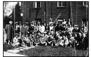
1942, Photo Index