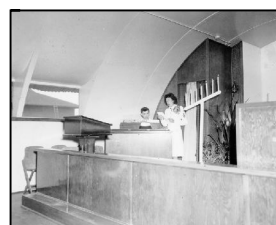
1946, The Blessing -

Residence (family): 30 Jun 1950 (age 29) Hayward, Alameda, California, United States 63 - Address: 21390 Locust St. [1] - House not on a farm [1] - House not on a place of 3 or more acres [1] Source List: [1] 1950 US Census, Walter W. Most household, Doc6403.pdf