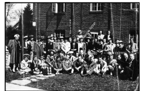
1942, Photo Index