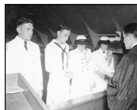
1946, The Blessing