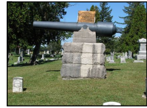
2014, Civil War Monument