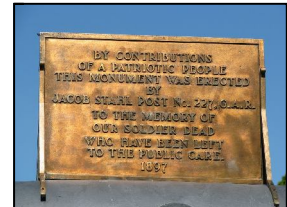
2014, Plaque on Civil War Memorial