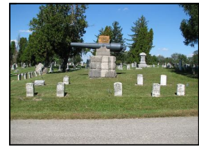
2014, Civil War Memorial