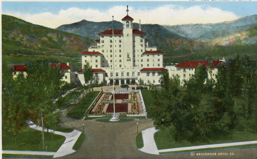
Colorado Springs, Colorado