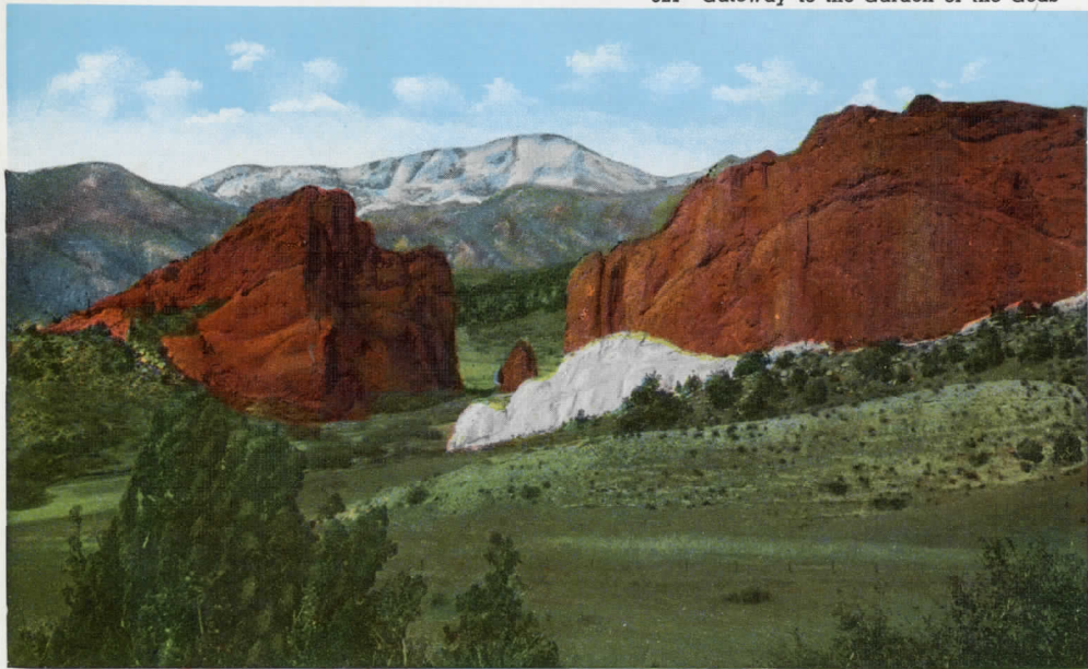
Colorado Springs, Colorado