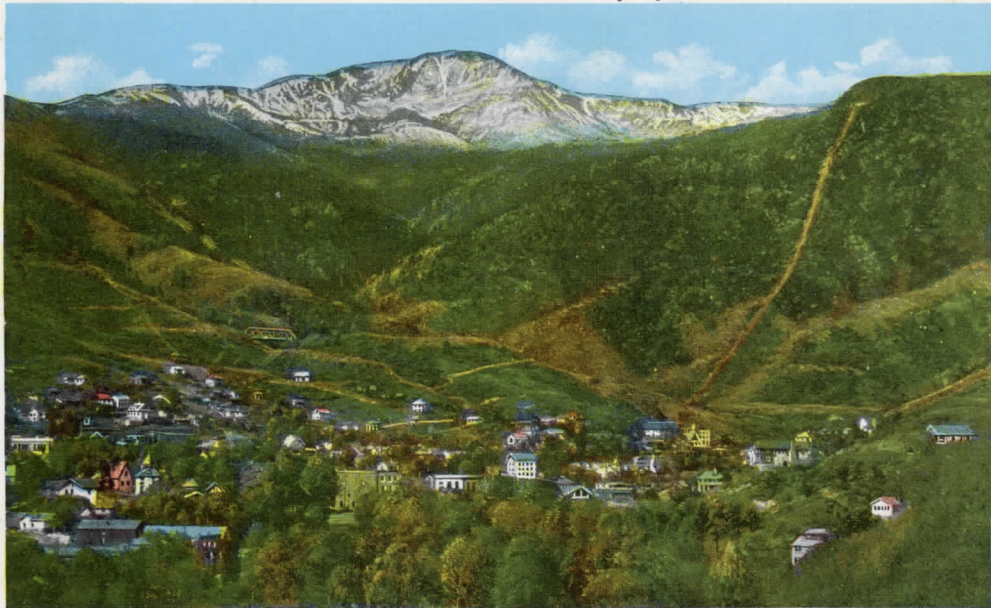
The Spa of the Rockies