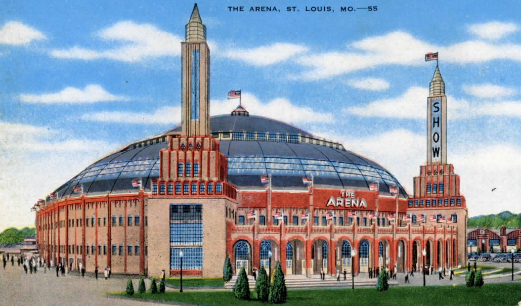
THE ARENA, ST. LOUIS, MO.—55