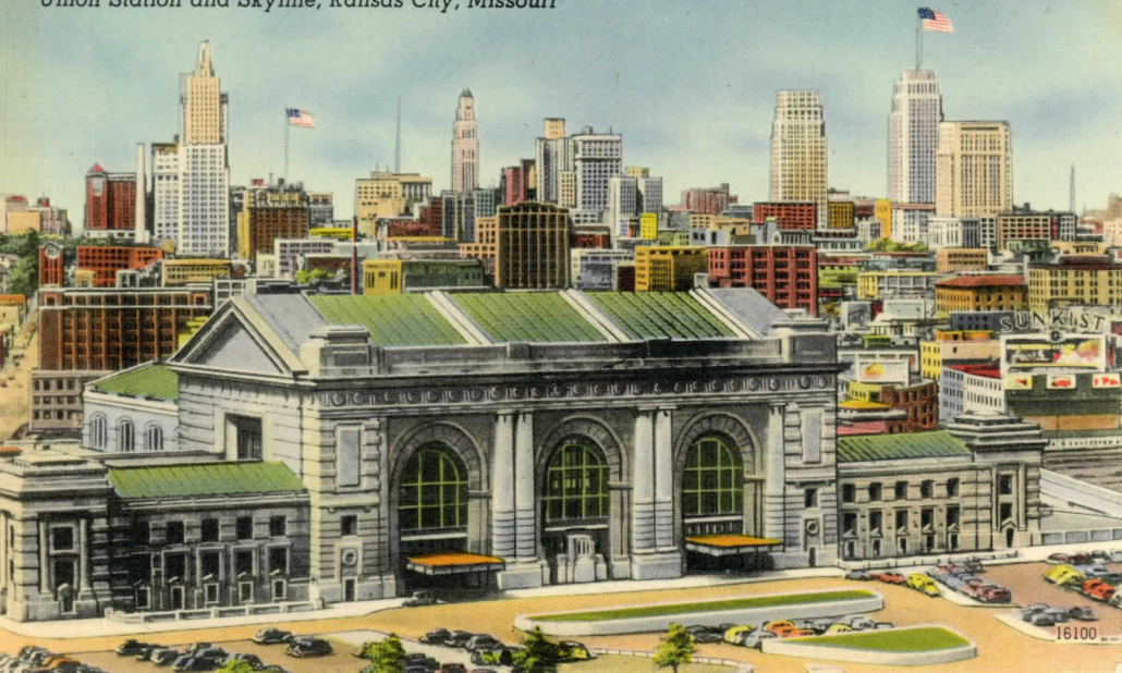
Union Station and Skyline, Kansas City, Missouri