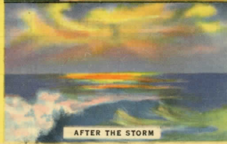
AFTER THE STORM