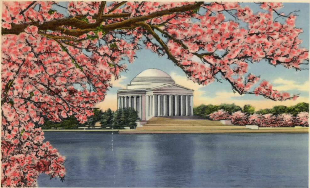
Jefferson Memorial, Washington, D. C.