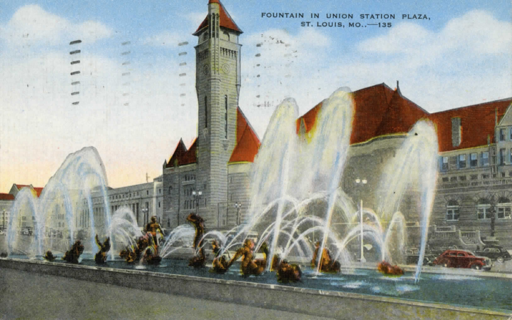
FOUNTAIN IN UNION STATION PLAZA, ST. LOUIS, MO.—135